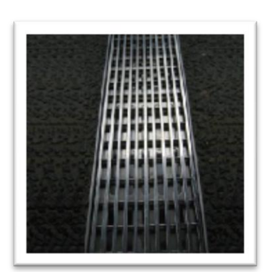
SSW Wedge Wire Grate