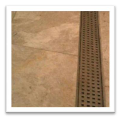
SS Stainless Steel Grate