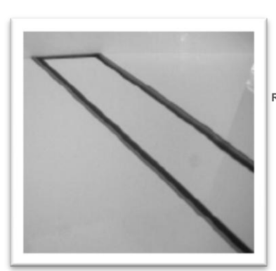
SST Tile Insert Grate